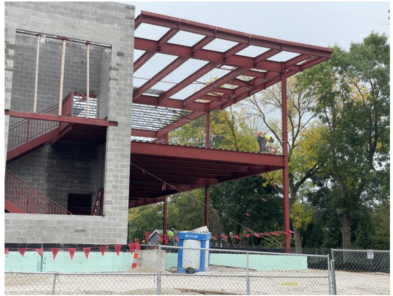
Steel stairs installed to the 2nd floor classrooms