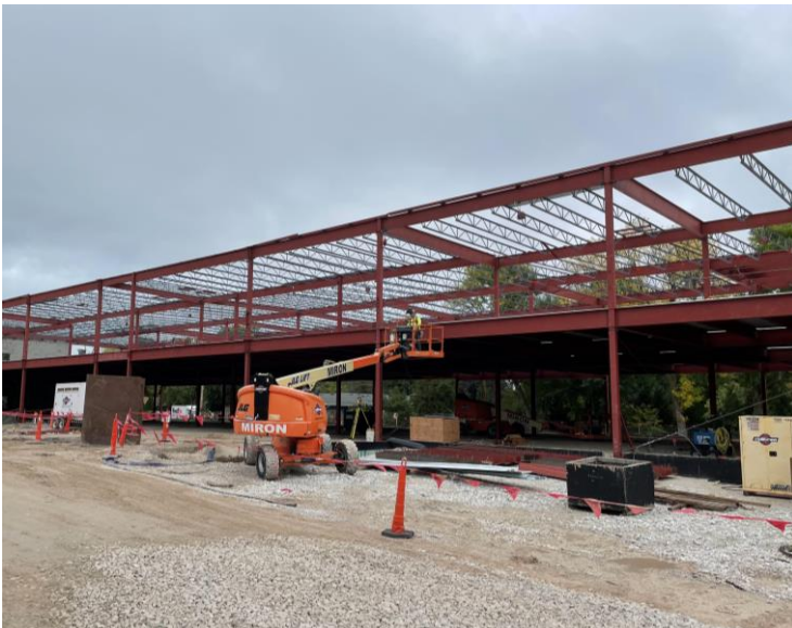
Structural steel for 2-story classroom wing and roof