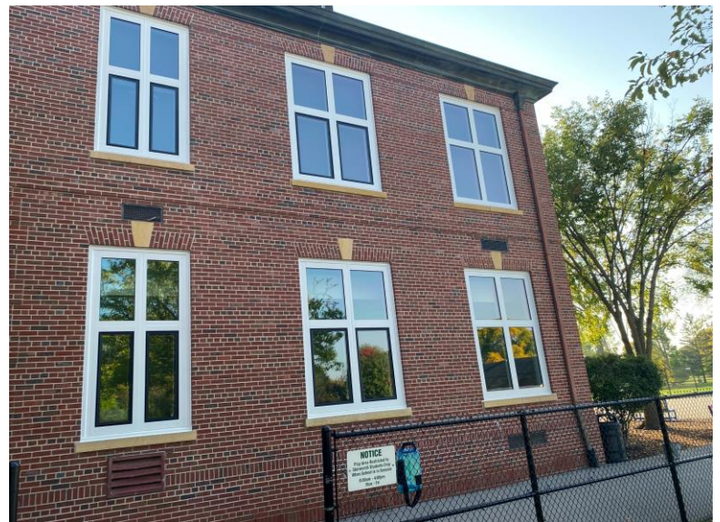
Stormonth - 230 new windows installed