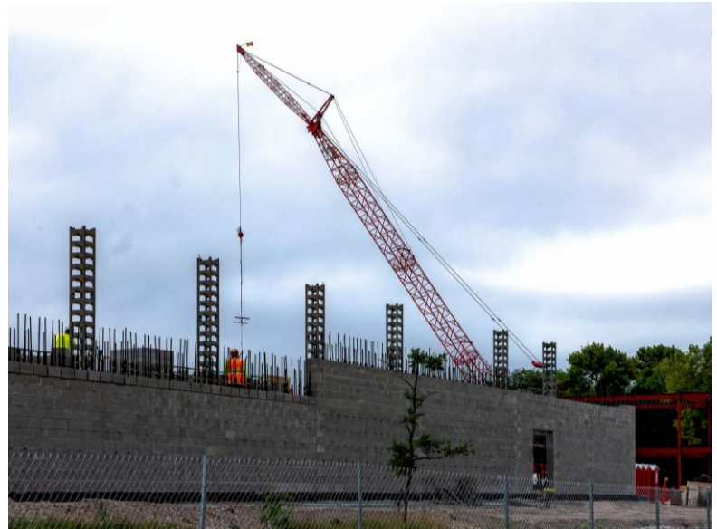
Bayside gym wall installation