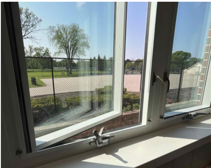
Stormonth received new energy efficient windows