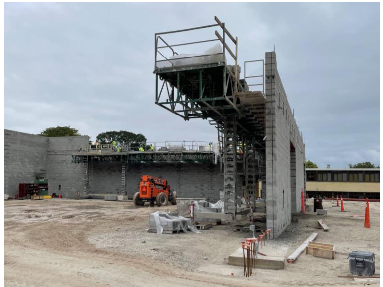
New gym masonry walls